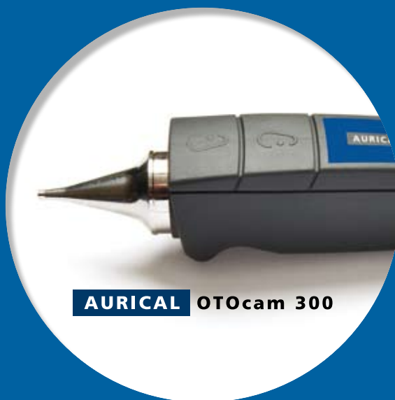
AURICAL OTOcam 300